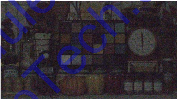
New product IMX323LQN Gain 45 dB